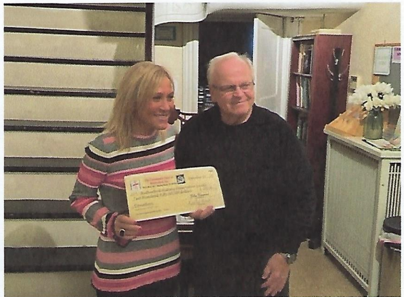
The RPHS would like to thank the Community Chest of Rutherford, NJ for their Support and Sponsorship!