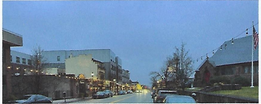
Downtown Rutherford (Park Avenue), on a rainy day during this Holiday Season.

Thank you for preserving Rutherford's History with us!