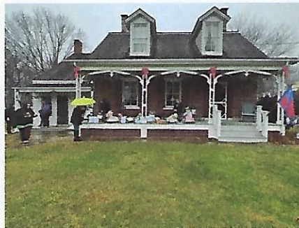
Volunteers for the USR Historical Society.