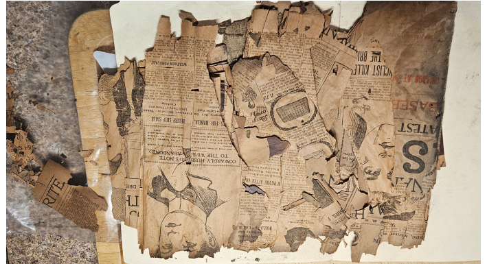
1899 New York newspaper